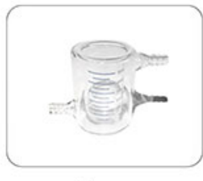
Glass Viscometer Cup