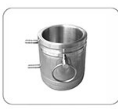
Stainless Steel Viscometer Cup